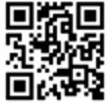
Facebook Fan Page